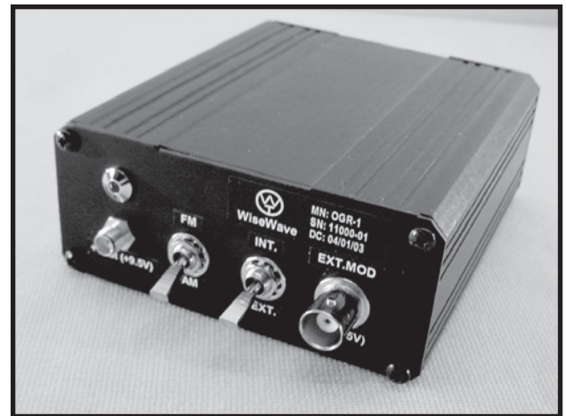
OGR & OMR Series