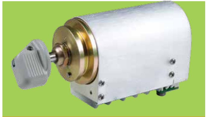
Rotary Switch: Engine Start Switch