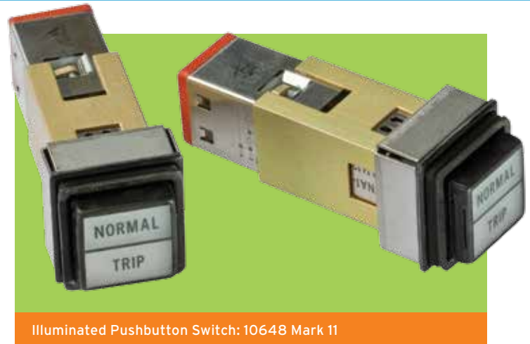
Illuminated Pushbutton Switch: 10648 Mark 11

Additionally, the universal dimmer switch has the ability to work with supply voltages of 12 and 28 (AC and DC) and electrical current up to two amps at 12 volts. This voltage feature is selectable via an on-board dip switch and makes it usable in a wide variety of aircraft. In addition, the switch incorporates on/off capability by simply pulling/pushing the knob, thereby reducing the number of control devices required at each station.